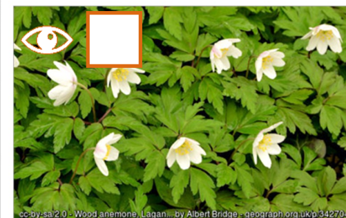
Wood Anemone "Wind Flower"

Old tree stumps and logs are a top habitat for fungus and beetles in woodlands.